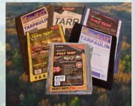
Import Poly, Vinyl and Mesh Tarps