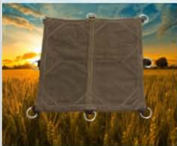
American Made Canvas Products