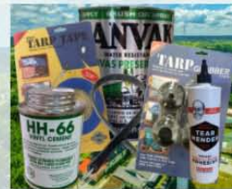
Roll Goods and Tarp Accessories