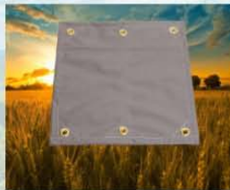
American Made Poly Products